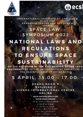
LSC 2022 - 61ST SESSION (ENGLISH)