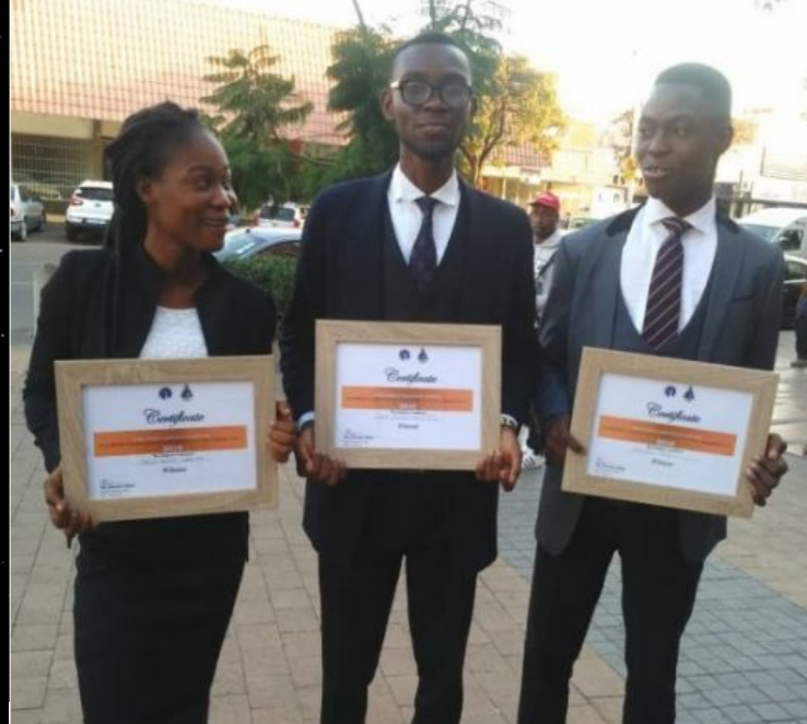
University of Calabar students, who won the Semi-Finals of the 2019 Manfred Lachs Space Law Competition against the McGill University team which represented the North America region.