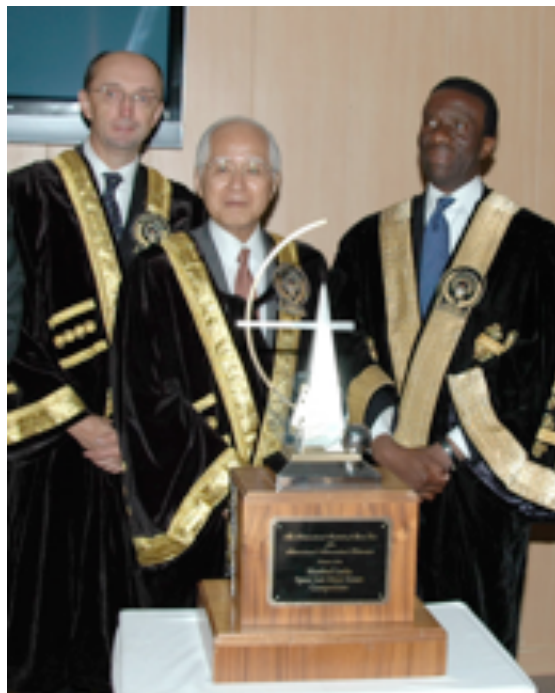
World Final 2007 Hyderabad, India

Address: Cockle Bay Wharf, Darling Harbour in Sydney