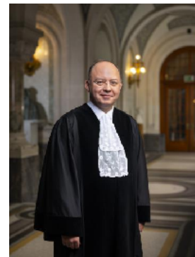
Judge Bogdan-Lucian Aurescu