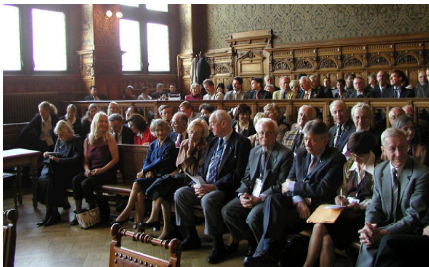
World Final 2003, Bremen, Germany