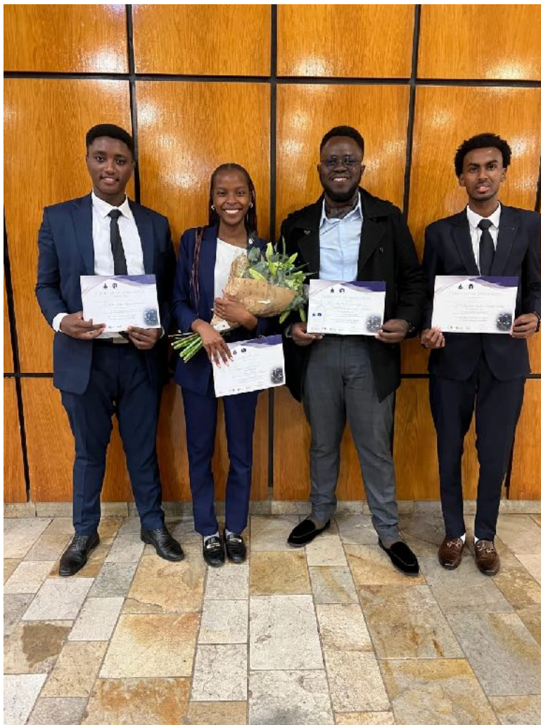
2025 Africa Winning Team