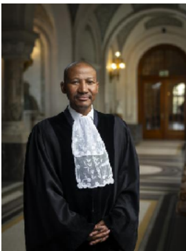
Judge Dire Tladi

H.E. Judge Bogdan-Lucian Aurescu, (Romania), International Court of Justice