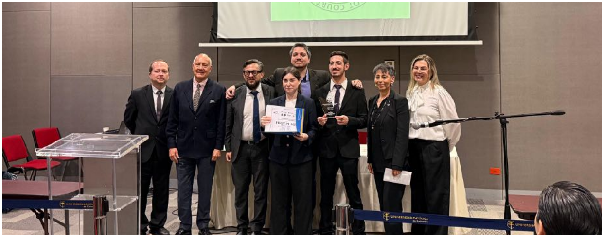
2025 Latin America Winning Team