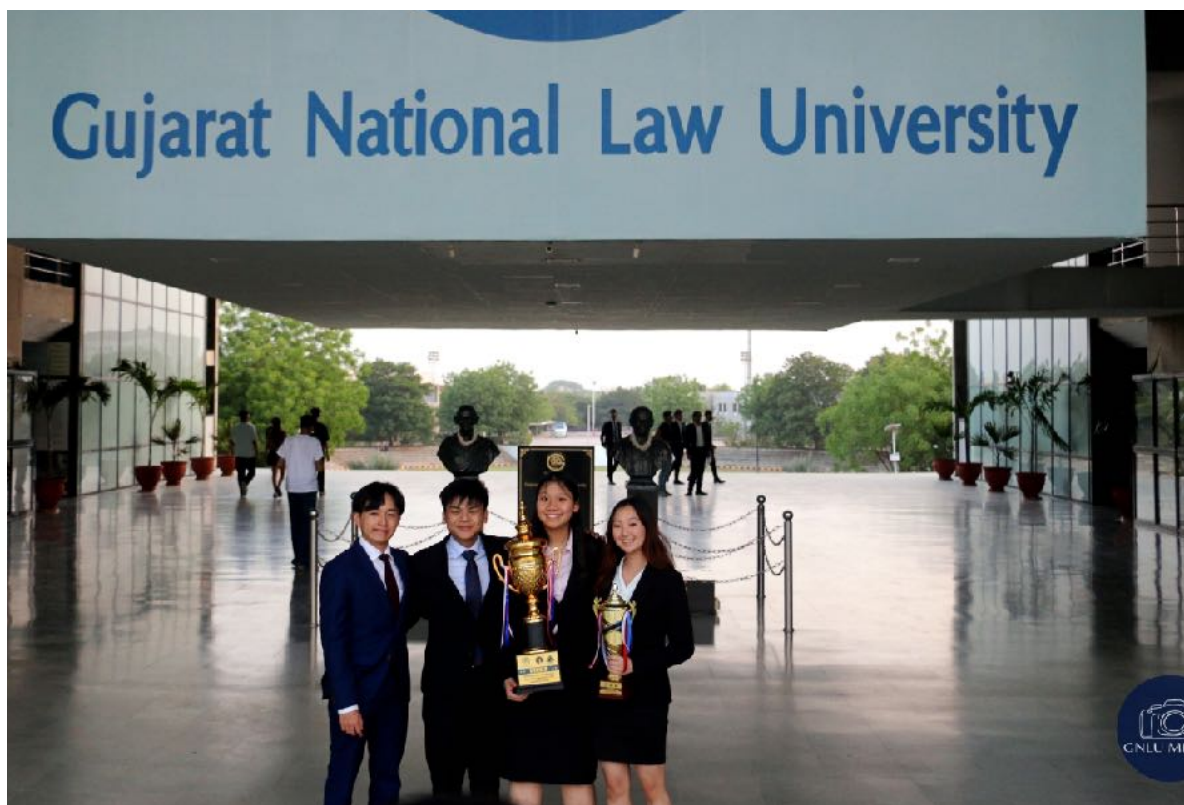
2025 Asia-Pacific Winning Team