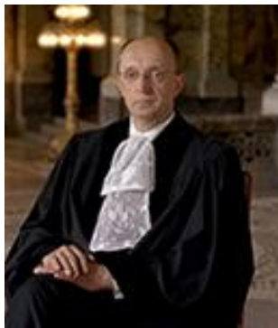
Judge Peter Tomka